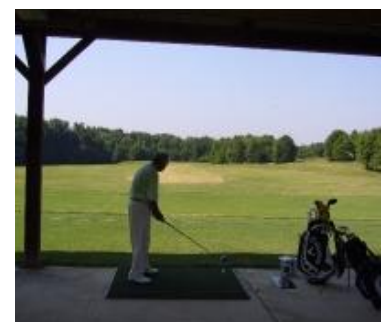
Cadillac Golf Ranch